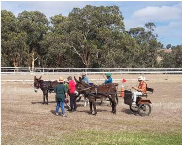
Above: Fun at the Quindanning Races.