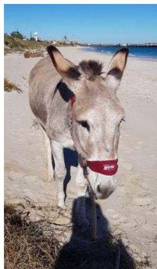
Below: A fun day out at the beach.