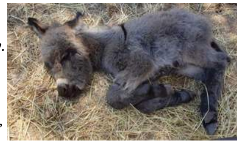
Below: Hermione at 5 weeks old on the Animal Aid Abroad walk.