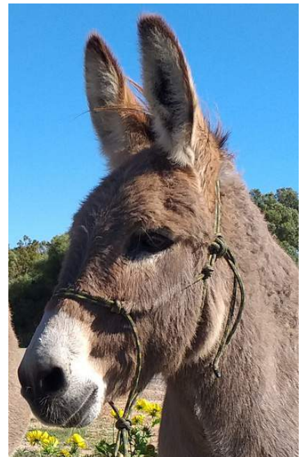
Pictured above: Shadow.