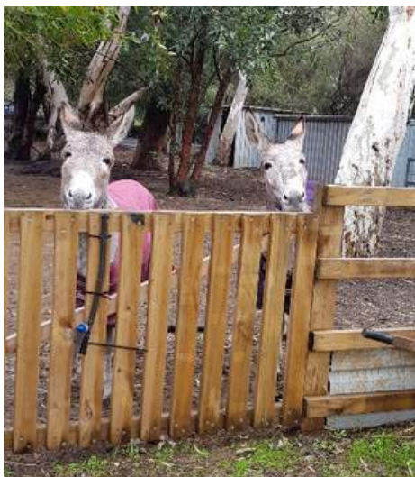
Below: Legacy and Neville.