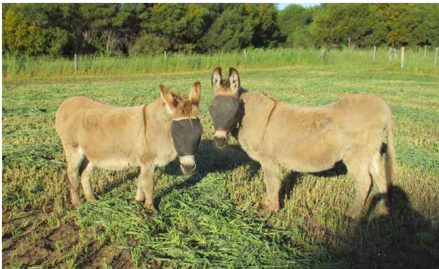
From left to right: Brave and Shadow enjoying the grass and sunshine.

So, fast forward to now, things have really turned a corner. I have a 'don't touch me' donkey coming to me of his own free will, sometimes before Brave has even seen me. He initiates ear rubs, allows butt scratches, and more recently brushing (I still keep the sessions short). He no longer turns his head when I reach out to rub his forehead. I can call them both down from the top paddock (most of the time) or if they are free wandering and I want to put them away, I can pat my thigh telling them to walk on and usually they will follow. We often see them chasing each other and on one occasion rearing up and play fighting. While I can spray Brave for flies without haltering him, Shadow will only stand still if haltered. I spray him gently and give him a treat before changing sides. Wouldn't say he enjoys it but I'm sure he will eventually realise the relief and get used to it. I have been touched deeply by the change in Shadow, and believe firmly that they teach us just as much as we teach them. I may not have got my riding donkey and that's ok, cause instead of owning one I now have two, and they are probably more suited to where I'm now at in life and a good fit for them as well.